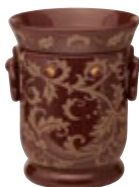
Plum Garland DSW-PLUM $30