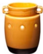
Maize DSW-MAIZ $30